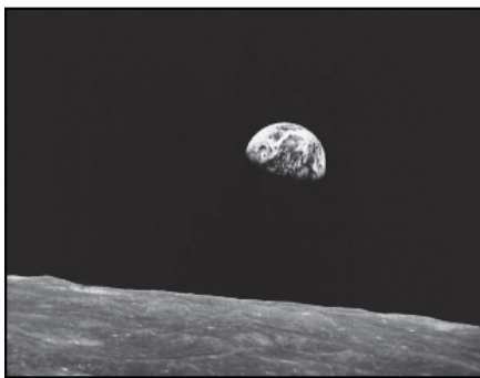
"Earth Rise," taken by the astronauts of Apollo 8.

Astrophysicists must apply for observing time on the Hubble, and as you might expect, many more applications are submitted than are accepted. As part of the director's discretionary time, a period of 10 consecutive days of exposures was allocated to document the phenomena in a random and unremarkable portion of the sky. The result